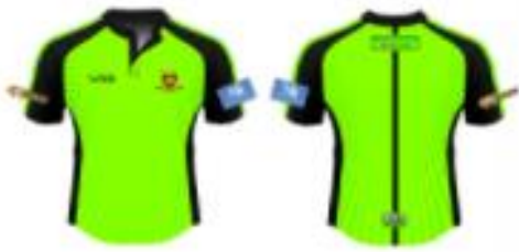
SemiFit Playing Shirt (Mens)

We now have an online Kit shop to purchase stash from to represent the society. As usual our committed referees will get Shirt, Shorts, Socks and underlayer to referee in. However, referees will now build up points for every game they do to spend in the shop on things they would like. There is an incredible range of items including padded jackets, assessor jackets and Gilets.