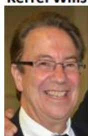
President and re-appointments Secretary