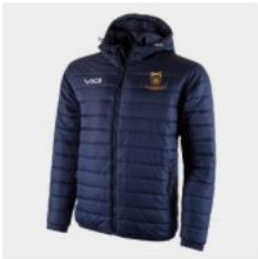
Pro Quilted Padded Jacket