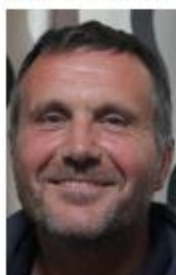
Chairman and Appointments Secretary