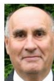
Match Observer Development Officer