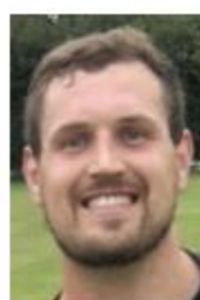
Promotions and Training Officer