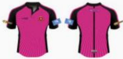
SemiFit Alternative Playing Kit (Mens)